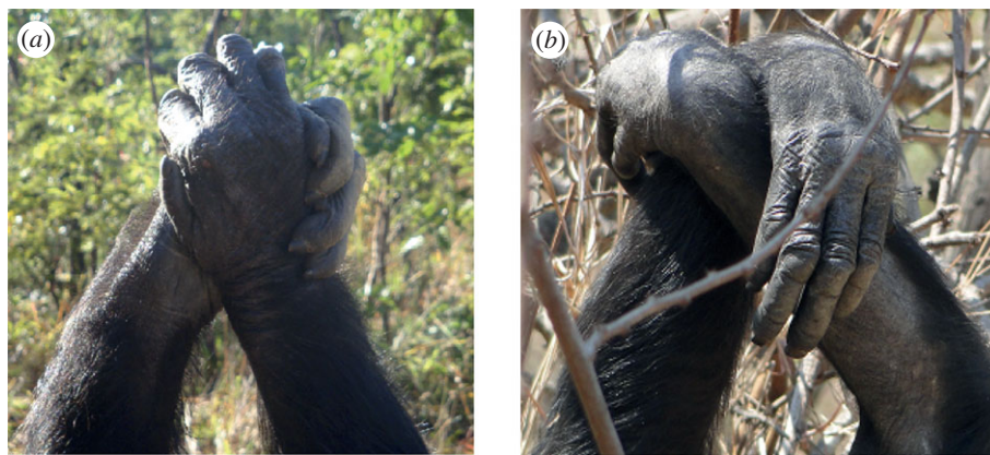
Figure 1. Grooming handclasp style examples: (a) palm-to-palm and (b) wrist-to-wrist.